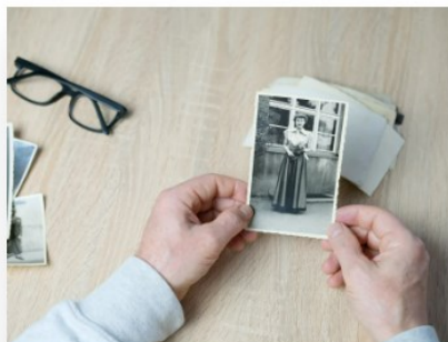
U.S. Census Research, Techniques and Strategies