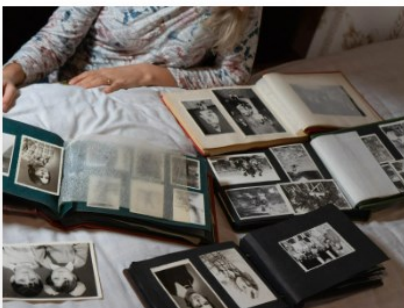
Research Process - Introduction